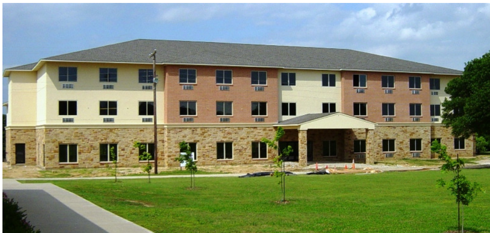
Curtis and Oneta Tally Retreat Center

The newest addition is the Curtis and Oneta Tally Retreat Center due to open on May 1, 2011, just in time for Keenage Camp. This three-story hotel-type building, equipped with an elevator, has 50 private rooms with full-sized bathrooms; three suites for group leaders; and large meeting areas for groups. The Tally Retreat Center