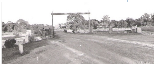
The old gate entrance